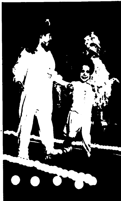
Sleepwear by Sesame Street is designed with room to grow