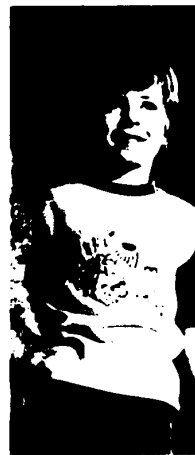
The whole Sesame Street clan shows up on this t-shirt