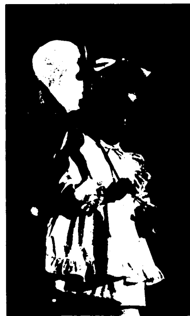
Pinafores with pretty appliques are still the trend for young ladies.