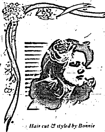
Hair cut & styled by Bonnie

Having your hair styled for your wedding day can be an enjoyable experience. Come in for a free consultation a month ahead of time and you'll be sure of having a natural and beautiful look.