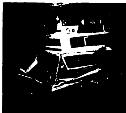
A security guard watches surveys the wreckage of the Detroit Bank and Trust Building on Maple Road, after this Winnebago crashed into the side.