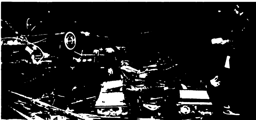
Reporter Ron Garburski of the Farmington Observer & Eccentric surveys the wreckage of two automobiles which were destroyed during the storm