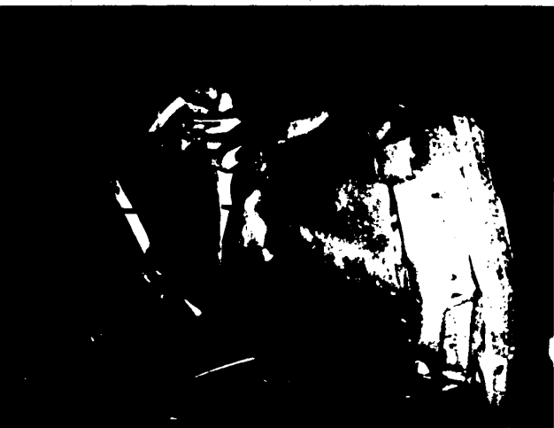
A wrecked car typified the situation this past weekend as the tornado struck parts of Farm-