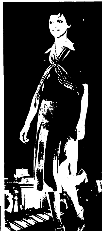
Short sleeves keynote this Nippon design for spring

VICTORIA NEEDLEWORKS Handbags n' Totes in tickings, canvas, and naturals $10-$25