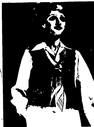
Albert Nippon knits the tiny-top sweater with scalloped armholes to feminize the vest, complete with a matching cloche