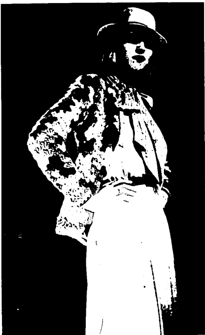
A crocheted sweater-jacket combined with silk from Bill Blass