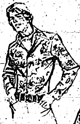
Most unusual spring sportshirts

Though the cover is all that, it's more. Aside from being married to each other, the Blochs go together fashion-wise, a sign that women are over their fads and men are done with dowdiness.