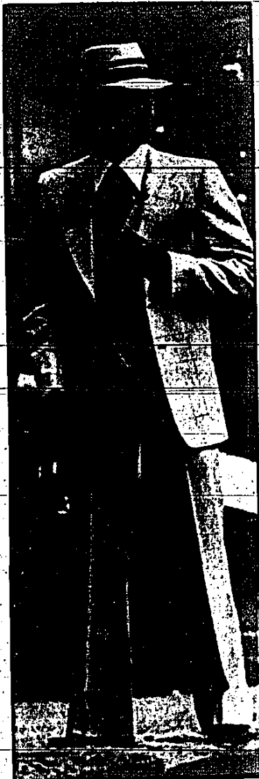
Minor Items Excluded

Offering THE MOST PRESTIGIOUS MEN'S —CLOTHING —SPORTSWEAR —HABERDASHERY —SHOES ANYWHERE IN THE COUNTRY!!