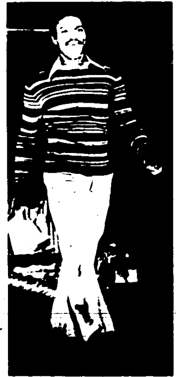
Ann Klein's Mark of the Lion looks more like a tiger as the striped sweater teams up with duck pants.