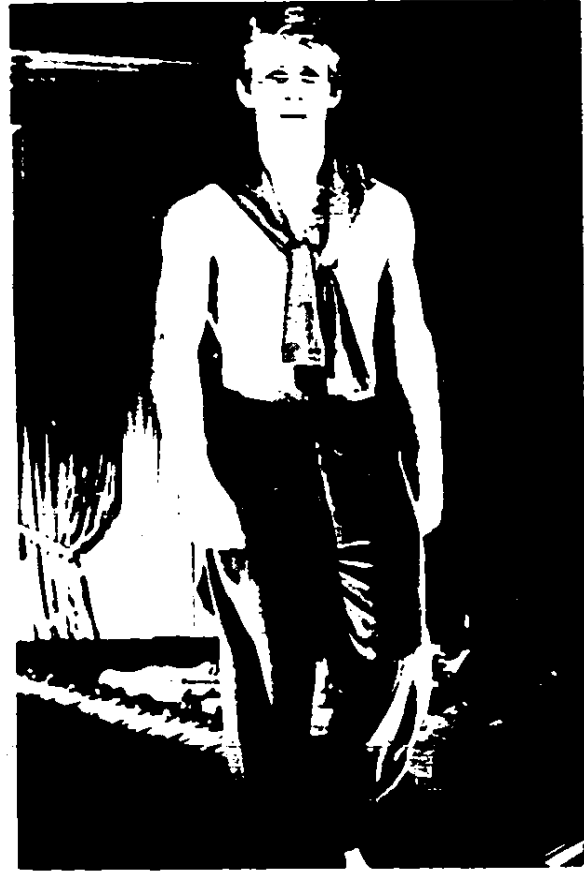
Anne Klein's Mark of the Lion sweatsuit certainly isn't acceptable for lunch at the Vineyards, but it couldn't be better for a quick jog around Quarton Lake.

28927 Southfield Rd. (just south of 12 Mile) Latrup Village Phone 424-8767