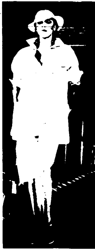
Oscar de la Renta's pastel checked tunic is one worth having