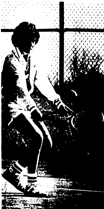
Danny Green won at No. 1 singles to help Harrison defeat Walled Lake Western last week