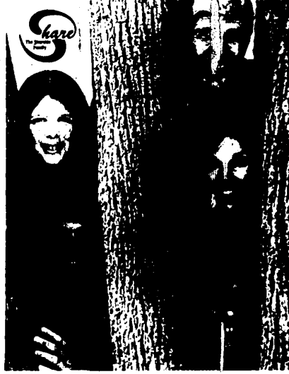
In cabaret concert