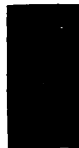
Bamboo Birdcages 3 sizes