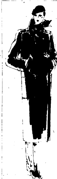
The reeler coat from Ramosport widens the shoulders and slims the hips.