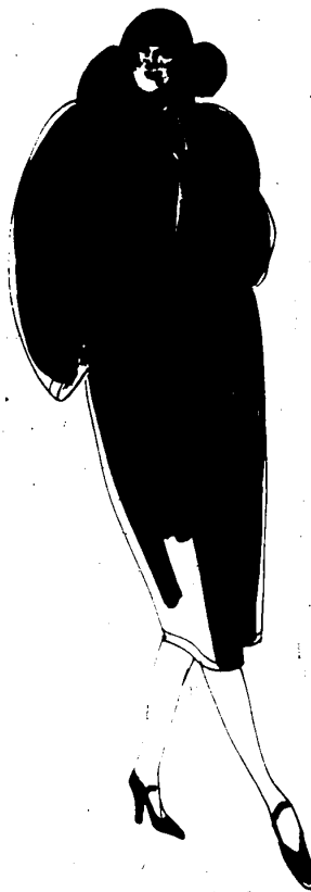
The slouched silhouette arrives for fall. (Sketches courtesy of Hudson's)

Remember the fashions that slouched over shoulders, billowed in the back, fitted a derriere and rounded the hips?