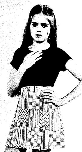
Skoater skirts that were $8 are now 5.90 and T-shirts that were $6 are now 4.40. (Cost possible!) Anyway skirts are 7 to 14, tops are $5-M, and one or several outfits are what you need to start through every day of summer. Girls' Collection.