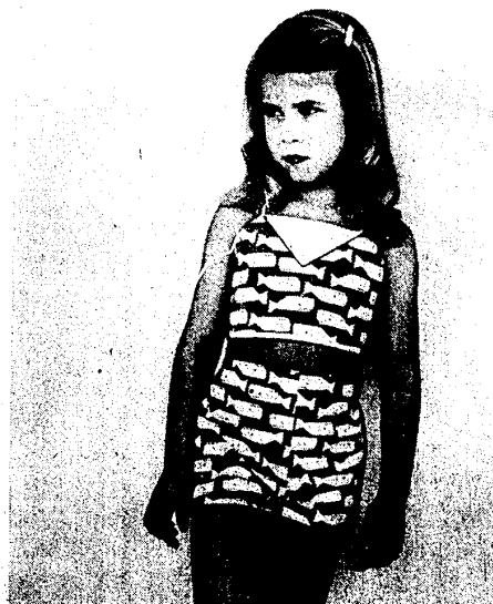
En fin, two piece short sets will show off your legs quite nicely as well as saving Mummy money as they are simply $8. For $4 to $5 a mix of prints. Girls' Apparel Collections.