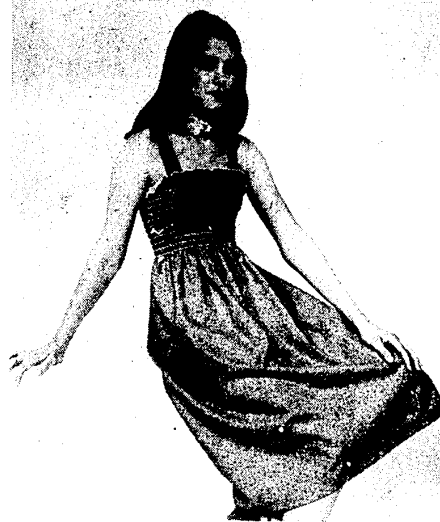
In the summery summer sales at Saks there are sundresses which you need studs of to be simply "au courant." Red calico, navy calico or gold plaid gauze are all 9.90. Preen size 5-8M. Actually, they are all polyester and cotton and used to be $11. The Spot for Young Teens

By 1978 the Nearly Me prosthesis will be on sale in 15 cities.