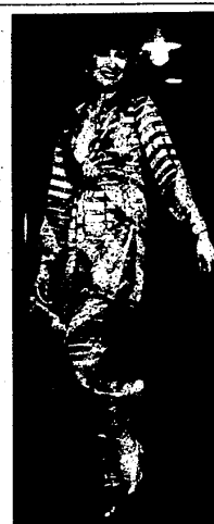
Tunic tops fell over pants and skirts.