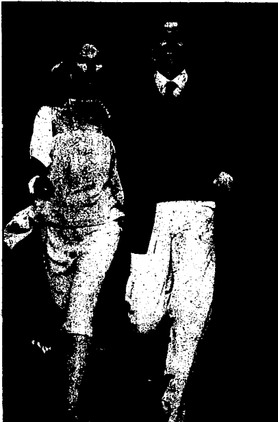
The clothes were soft and loose and flowing freely as models danced their way through the fashion production. Clothes were from Hattie's of Birmingham.