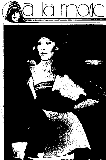
Silk shawls worn draped over one shoulder fit into the picture.