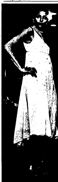
The boudoir look was not forgotten.