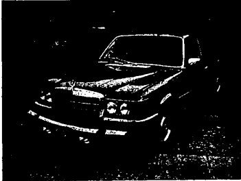
The new 280SE. Subtle dimensions in a 6-cylinder sedan.

Suspense-free suspension The advanced front suspension system of the 280SE derives from the famous