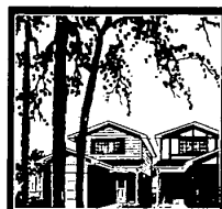
Monday, June 20, 1977

Registrations continue until all classrooms are full. They are taken on a first-come-first-served basis by calling the center at 477-8404.