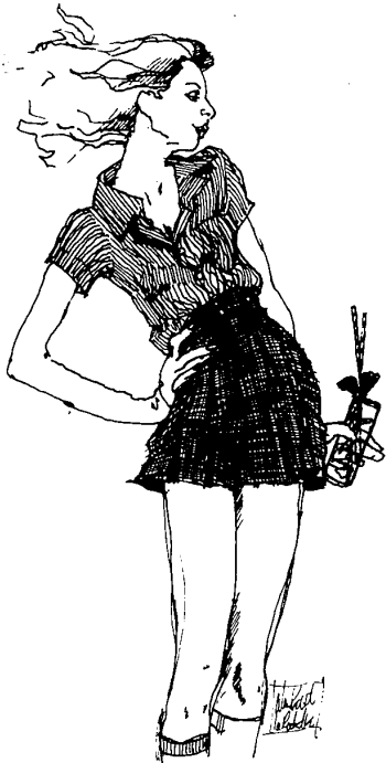
RALPH LAUREN'S P.J.'S