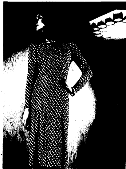
Diane Van Furstenberg's new shape... loose and easy. With a marvelous neck tie you can leave open, a strappy soft belt you can leave off. Brown and white or royal and white acrylic knit, sizes 4 to 14. $76

Diane Van Furstenberg Boutique Saks Fifth Avenue