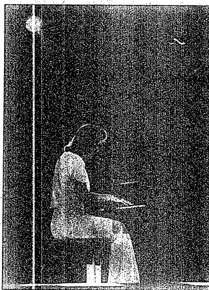
Under the talent spotlight...