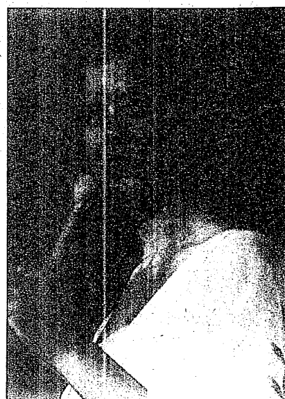
Personality and poise...