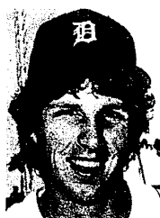
"THE BIRD" MARK FIDRYCH

SEE "THE BIRD" "THE ROSE" AND MICKEY STANLEY THURSDAY, AUGUST 11 2 P.M. TO 4 P.M. AUTOGRAPHING SESSION BY DETROIT TIGERS