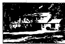
ENJOY NATURE . Heavily treed near acre, Lake Privileges with sandy beach, Central Air in 4 big bedrooms, 30'x20' family room with wet bar, 21'x13' library with fireplace, 22' kitchen. West Bloomfield. 626-9100. $109,900.