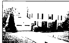
OVER 3,000 Sq. Ft. Immaculate 4 bedroom home, paneled family room with fireplace, private library, first floor laundry, walk-in closets, Central Air, garage openers. Convenient Birmingham area. 646-6000. $94,900.