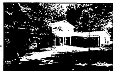
WOODED RETREAT in Farmington Hills. Roomy Colonial, library or 4th bedroom, fireplace family room, finished rec. and game rooms. Complete 16'x13' kitchen, full basement. Immediate Possession. 626-9100. $79,900.