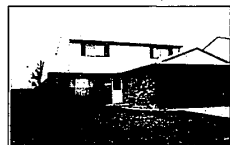
BEAUTIFUL 4 bedroom, 2 1/2 bath Colonial. All custom drapes, shutters, 2 year old carpeting. Plus newer Central Air, top-of-line built-ins, paneled family room. In desirable Southfield location. 557-6700. $65,000.