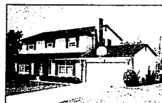
GOOD VALUE in Oakland Township. On large setting with mature shrubs and trees. Large foyer leads to living room with fireplace, formal dining room, Florida room, full basement. Sprinklers, 2-car garage. 651-8850. $58,900.