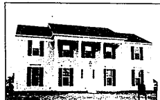
ROCHESTER FARMS offers this stately pillared Colonial with three doorways off large living room and dining room. Plus 3 big bedrooms, 2 1/2 baths, island kitchen, full basement. Immediate Possession. 651-8850. $68,900.