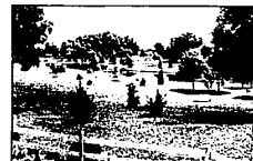
JUST AS NICE inside. Attractively decorated 4 bedroom Colonial backs up to 17 acre commons park. Center hall back to fireplace family room, complete kitchen and nook. Garage openers, gas BBQ. 626-9100. $94,900.