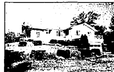
EVERY COUNTRY GENTLEMAN'S dream—16 pastoral acres, lovely pond stocked with fish and rolling fields with a variety of trees. The well kept 1968 Ranch home features comfortable family room with fireplace, 22'x11' kitchen with built-ins, three bedrooms, 1 1/2 baths and basement. Two car garage has openers. Several outbuildings and tractor included. Attractive Land Contract terms. Get away from it all and call 689-8900. $139,000.