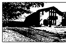
STRIKING California Spanish Colonial on 1 1/2 acres in Bloomfield Hills area. Spectacular interior, huge two-story family room—kitchen—breakfast area with white mica fireplace and balcony. Lake view. 626-9100. $176,500.