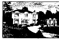
PALATIAL SPLENDOR , Private Bingham Farms estate. White Italian marble foyer, custom carpeting, rich panelling. Spacious, all the comfort features. A 1974 French Colonial classic, Birmingham. 646-6000. $189,000.