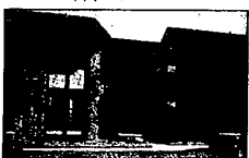
SOUTHFIELD Condominium, 4 years old, beautiful decor. 3 large bedrooms, natural fireplace in large living room, all kitchen built-ins, full basement, Central Air. 557-6700. Easily assumed at $46,900.