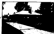
MANICURED 3 bedroom Ranch with 2 full baths, natural woodwork, fireplace, Central Air, electronic air cleaner, finished rec room with kitchen, large garage. Near Southfield Civic Center. 557-6700. $43,900.