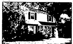
LIKE-NEW 4 bedroom home. Since 1972 aluminum siding, insulation, library, Central Air, furnace and electronic filter have been added or replaced. Fireplace, finished rec room, 1 1/2 baths. Birmingham. 647-5950. $59,500.