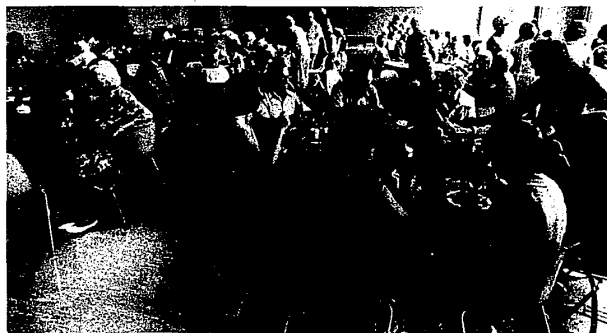
Seniors enjoy their first meal in the Mercy Center dining room.

"I'm going to bring my bed and stay," she laughed.