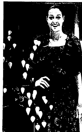
A two-piece dress has sharp pleats in the skirt and soft touches like puffy sleeves and ruffles above.