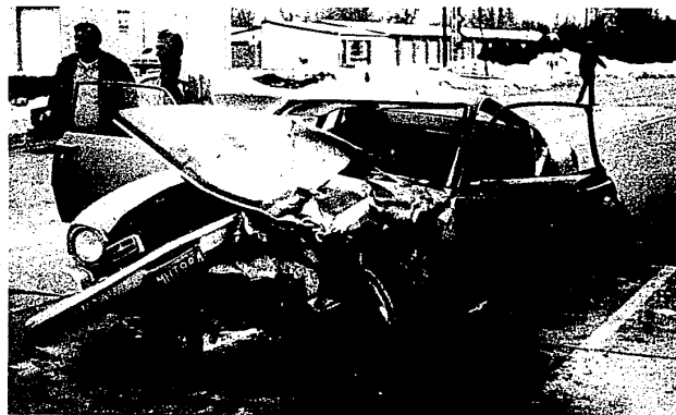
A Maverick was damaged and its two occupants injured in a two-car crash on Eight Mile near Whitlock Thursday.

THE CADILLAC was headed west on Eight Mile road near Whitlock in Farmington Hills when it collided with the Maverick which was attempting to turn into the eastbound lane, according to police.