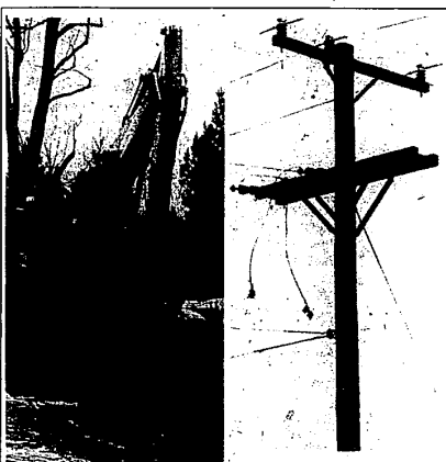
Electrical wires over a construction site were severed by steam shovel arms which were raised too high. The 13,200 volt wires caused the electrocution of a 41-year-old construction worker.

Edison Safety Inspectors help put out the smoldering blaze which damaged a wall and her washer. No one was home at the time.