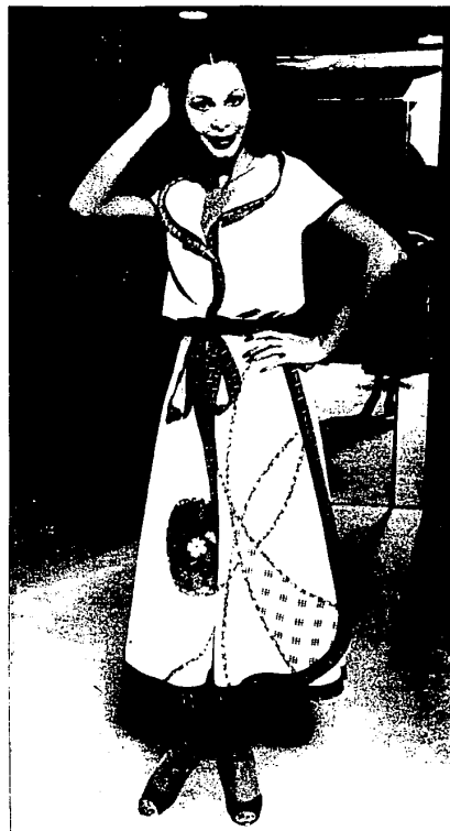
Collage wrapped skirt in assorted trimmings is designed by Koos Van Den Akken and is shown with a white linen blouse with trimming and a button-down front.

If it all seems confusing, it really isn't at all. What's necessary is to relax, shed all your iron-clad cliches about what is right for you and look for what's comfortable, soft, and female. It's now okay to look demure, outrageous, subtle brazen and even sexy—and to have fun doing it.