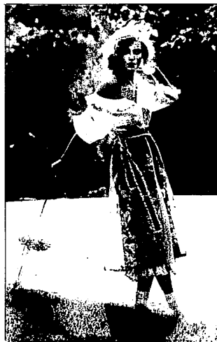
Shoulders are bared in these two fashions for spring. (At left) A whimsical print skirt with petticoat peeking out at the hem is topped by a easy sheer