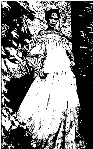
blouse. (At right) A confection of beige and white stripe silk taffeta is meant for romantics.