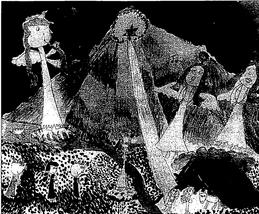
Jessie Frcka won a bicycle with this complex nativity scene.

All Oakland County entries can be picked up at the Observer & Eccentric's Birmingham office, 1225 Bowers.