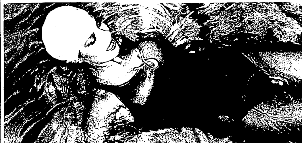
A John Kloss keyhole and bow signature racing suit is guaranteed to hold its form—and yours.

To keep you always looking well put-together, the suits and cover-ups are all in dyed-to-match colors, ranging from bright vivid shades such as cherry red and light green, to pastel stripes and solid sugarpink colors. Black is also available in the mailot suits.