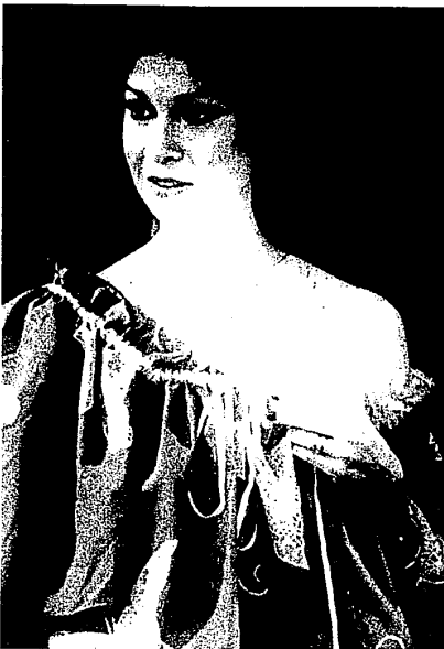
The pretty as a valentine sweetheart dress comes from Yves St. Laurent in a poly-blend that resembles chiffon.

They will also take special orders and stress giving a personal touch, along with quality, fashion and elegance.