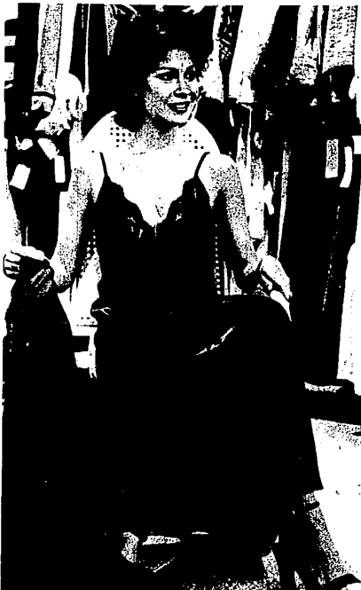
Brown satin remaque with black lace trim is used for the robe and gown designed by Ora Feder.