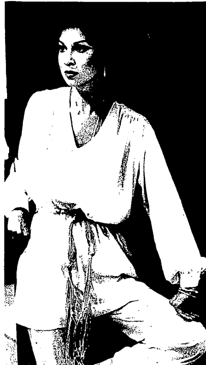
The natural two-piece lounge by Oscar de la Rente is washable, packable, season-less, and is considered a perfect travel piece.