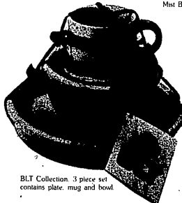
BLT Collection. 3 piece set contains plate, mug and bowl.