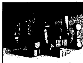
Teak Salt Peppermill Combinations