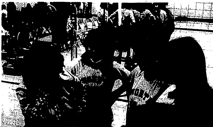
North Farmington volleyballers confer with a coach during the Schoolcraft Tournament.