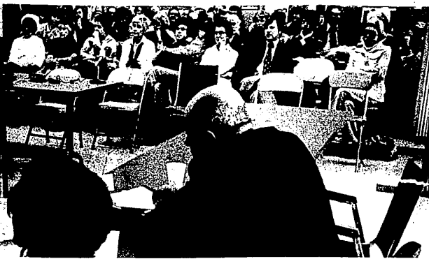
Staff members, administrators and parents crammed the afternoon session of the public hearing in board offices this week, as the Task Force on School Organizational Structure (SOS) listened to the community's comments on middle schools.

Monday thru Friday 9:30 to 8, Sat. 9:30 to 6, Sun. 12 to 5 TERMS ARE AVAILABLE (Across from R & M Department Store)