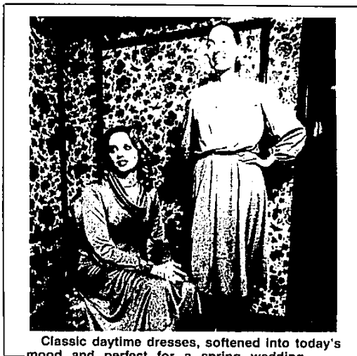
Classic daytime dresses, softened into today's mood and perfect for a spring wedding.

"If you do wear a blouse and skirt," she added, "then accessories become important. Most women know when they look good, but most women don't