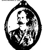
Sir James Buchanan (Lord Warrington) 1806-1915 Founder of The House of Buchanan

"At The House of Buchanan, we still believe and blend as my grandfather did. It is a family tradition. A matter of family pride. Pride in the excellence of the blend which bears my grandfather's name and mine, Buchanan's 12."