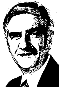
JOHN J. RICCARDO

John J. Riccardo will join the ranks of metropolitan Detroiters who have been feted as Knights of Charity. Riccardo, chairman of the board and chief executive officer of Chrysler Corporation, was honored for his efforts on behalf of the community, its citizens and various charity groups.