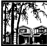
Monday, February 27, 1978

Worldwide mission activities conducted by the PIME Fathers include 720 schools, 25 hospitals, 141 outpatient clinics, and five leprosaria.