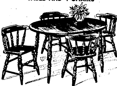
TABLE AND 4 CHAIRS

42" x 42" x 54" ROUND TEXTURED COLONIAL MAPLE. PLASTIC TOP, PLASTIC EDGED TABLE WITH 4 COMMODORE CHAIRS.