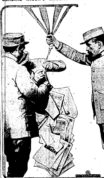
The French translated President Wilson's war message into German, attached printed copies to small balloons and thus sent them across to the German troops.

Learning to Fight. "I'll say this much for Mrs. Dibble." "Well?" "She used to be a 'kind little creature,' but she has acquired a great deal of self-reliance since she joined the housewives' boycott."