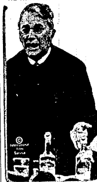
This is Georg Ledebour, the German independent socialist, who told the reichstag that revolution must come in Germany as it had in Russia.