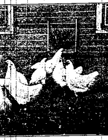
A Flock of Chickens Like This Will Pay.

East Lansing, Mich.—In the large problems of drainage which confront the many sections of Michigan the traction ditcher will play an important part. Labor, formerly available for this purpose is constantly being depleted, especially since the opening of the war. We are advised on every hand to make increased use of machinery in all farming operations. There is perhaps no machine which will do