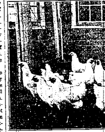
A Flock of Chickens Like This Will Pay.

Take six pounds of feed to produce a dozen of eggs on the average farm. Taking the present prices as quoted for grains, September 22, 1917, wheat, $1.02; oats, 65 cents; corn, $2.25; and bean, $3.85, it costs a farmer to raise the ration we recommend