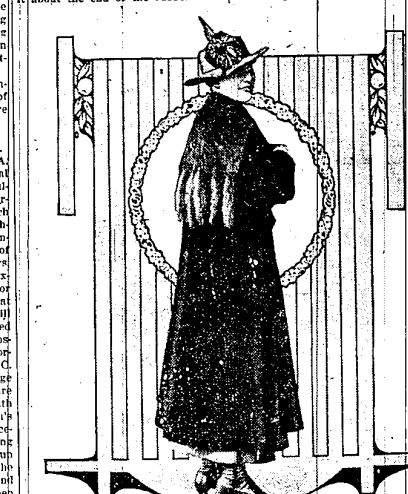
For Girls of the Northland

In the little group of novelties pictured here there are corsage ornaments and a small bit of neckwear. The ribbon rose is made of pink satin ribbon in two shades; cut into long lengths to form the petals. It is not difficult to make when the breast is once acquired. Millinery stems and collars and millinery stumps are used with ribbon flowers. The center of the rose is formed by folding the darker shade in the ribbon and wrapping it about the end of the rubber stem.