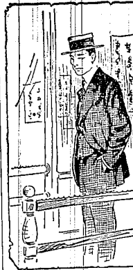
They No Longer Wear "Pig Tails."

No Opium Smoking Now. In one of these places a waiter could make $10 a night, for he not only had the right to take tips, but all