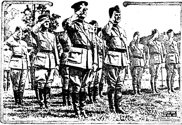
Gen. John J. Pershing and officers of the First division are here shown saluting the colors as the Sixteenth Infantry passes in review.