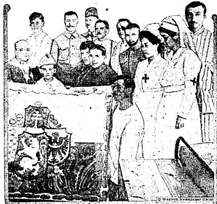
Another example of the pathetic after-effects of war is shown by this photograph of a number of maimed Czecho-Slovaks who were wounded in battle.