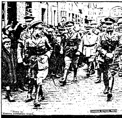
After the Germans had retreated from the village of Denain, the scene of bitter fighting by the Canadians, the prince of Wales and General Currie entered the place at the head of the Canadian troops.