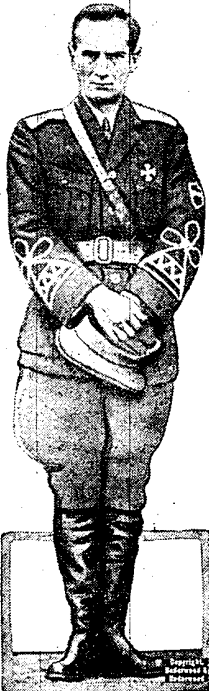
Through a coup d'etat at Omsk, Admiral Kolchak became virtual dictator of the all-Russian government...

Safe Bet. A little boy had a pony and a dog, and his generosity was often tried by visitors asking him—just to see what he would say—to give them one or both his pets.