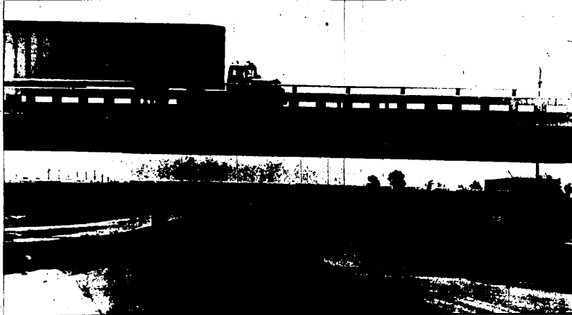
Looking south on I-275, a trailer truck passes over the Grand River bridge as construction crews ready the expressway for its late fall opening date.