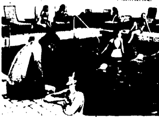
ONE QUEEN RD. TORONTO, CANADA • DIAL 9 • TELEPHONE 6332 OR SEE YOUR TRAVEL AGENT

Tennis & golf arrangements upon request.