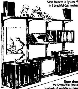
Shown above, the Stereo Wall (one of hundreds of available systems)

Same features in System 25 in 2 beautiful Oak finishes