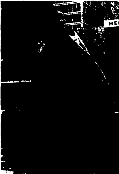
Designer Bill Blass is prepared for anything with his ranch mink coat with its own matching rain cover.