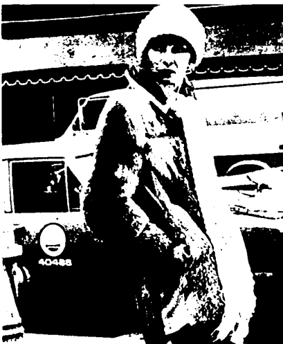
A red fox coat with leather side panels and detailing is super functional with dramatic overtones.