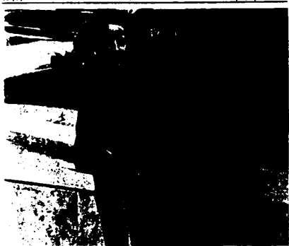
Leather at the sleeve and for the belt of this versatile fur is the touch which adds to its versatility.