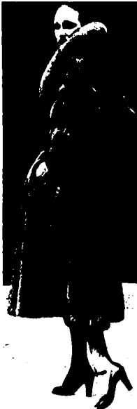
Shades of mink, this one mauve, combined with sweatering detailing at the waist and cuffs and matching fur collar create a 1976 identity.

A SHORT NATURAL Belgian nutria is another that dresses up or down, combines with any color and texture from polished leather boots to a glittering, bronze Lurex jumpsuit. The final segment of the presentation was furs for the individualist. If you weren't an individualist before wearing them, you certainly will be after. John Anthony's silvery, natural full length racoon, the full length natural Belgian nutria with a dyed fox tuxedo trim, the dramatically marked American lynx or the natural Chinese fitch in Calico cat colors are instant attention getters. Fur salon staffers are quick to point out that today's furs come from animals raised specifically for their furs, just as some are raised for meat. Protected species are never turned into wearables. It may be 90 degrees in the shade, but area fur salons are already stocked and ready for a long, cold, lovely winter.