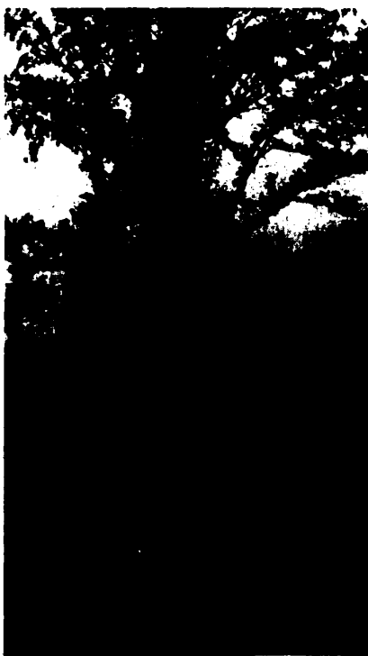
Scenic Lower Huron Metropark draws picnickers from the Belleville area.