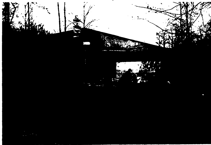
Nature Center is main feature of downriver Oakwoods Metropark.