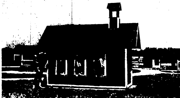
Tot lot with child-sized schoolhouse drew Mary Jo Comb (left), 10, of Plymouth and friends to the new Willow Metropark.

Four hiking trails in the nature area vary from 700 feet to two miles in length. Bring your camera.