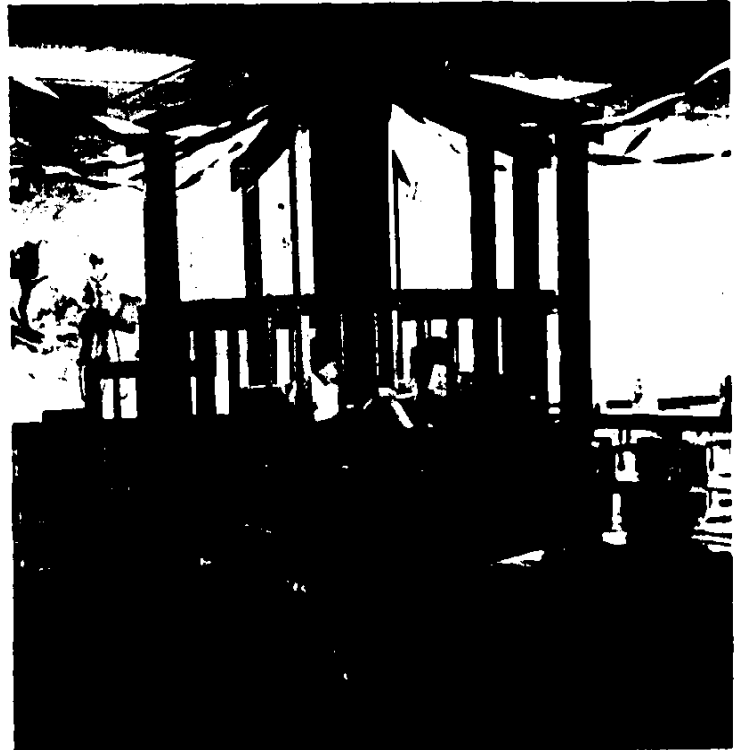
This children's room complete with tree house in the new library on Liberty Street is a long way from the old days when a library had a couple of shelves for young people who had to go home if they wanted to sit down. Now, Farmington youngsters come to the library to spend time selecting books in comfort and colorful surroundings.