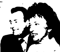
By ERNEST AND KAY CLINTON

There are several things you can do to help your room air conditioner keep the inside of your home cool and that saving summer heat outdoors where it belongs. • Improve your home's insulation (seal doors, windows and close fireplace flue) • Draw drapes or blinds on the sunny side of the house • Keep the air filter clean, and check to be sure the air flow is not blocked by drapes or furniture Following these tips will help you and your house keep its cool.