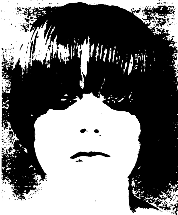
The best of today's cuts look good wet.