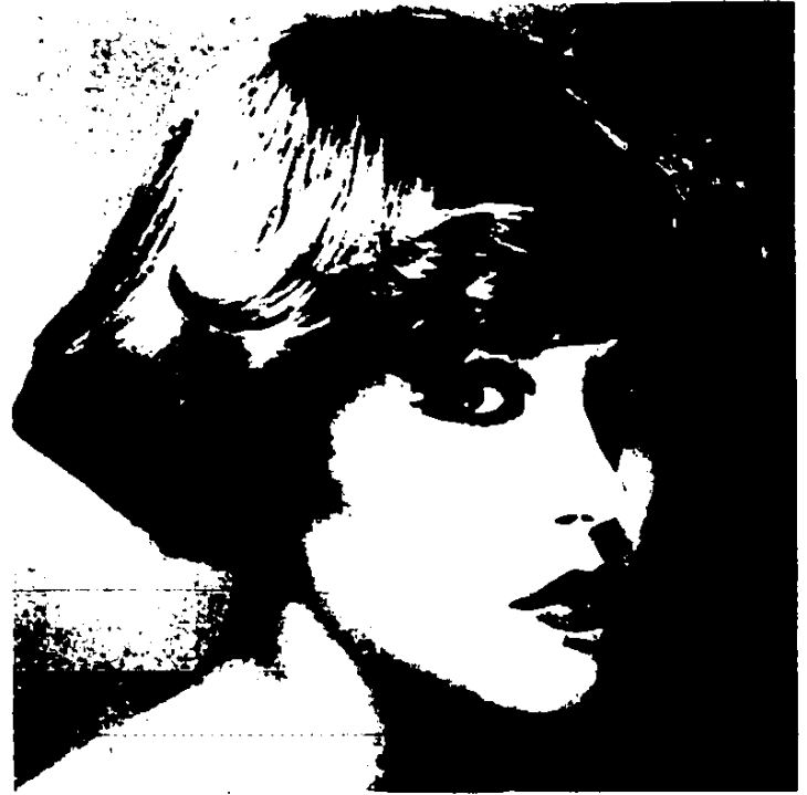
The Best of Cuts . . . Soft curls frame the face in this short, feminine new hair style.

The best of today's hair fashions do, indeed, require the best of cuts!