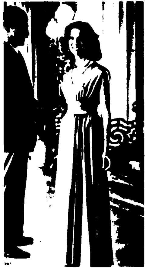
Soft flowing elegance.