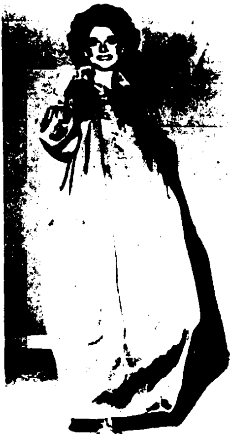
The beauty of satin.