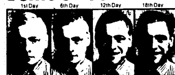
Time-lapse photographs show how gradual action of Grecian Formula 16 lets you control just how much gray you slowly get rid of — some of it or all of it.

White Plains, N.Y. — Hundreds of thousands of men and women over the age of 30 are now using a remarkable product to control just how much gray they slowly get rid of. It is called Grecian Formula 16, and the results are simply amazing. Grecian Formula 16 is a practically clear liquid, as easy to use as hair tonic. This remarkable formula works for any color hair because it combines with the natural chemistry of the hair to recreate natural-looking color. There is no mess and no rub-off. You simply use it every day for two or three weeks until you slowly get rid of